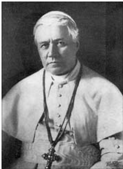
Pope Pius IX (1792-1878). White Pope from 1846 to 1878.

"For the Syllabus, as appears from the official communication of Cardinal Antonelli, is a decision given by the pope speaking as universal teacher and judge to Catholics the world over. All Catholics, therefore, are bound to accept the Syllabus. Exteriorly they may neither in word nor in writing oppose its contents; they must also assent to it interiorly. " ( Catholic Encyclopedia article Syllabus).