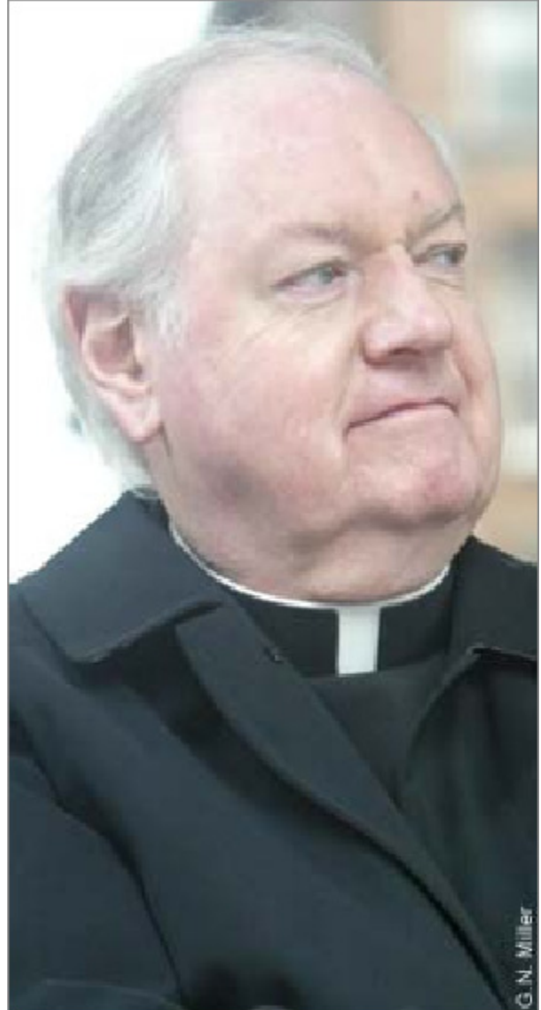
DISS: Dems want to remove Cardinal Egan's name from a resolution sponsored by...

It states: "Whereas the Archdiocese of New York is currently under the spiritual guidance of His Eminence M. Cardinal Egan, who was installed on June 19, 2000, and elevated to Cardinal on February 21, 2001."