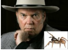
PHOTOS: Spiders & Celebs in Name Game