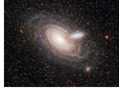
PHOTOS: Hubble Captures Galaxy Shadows